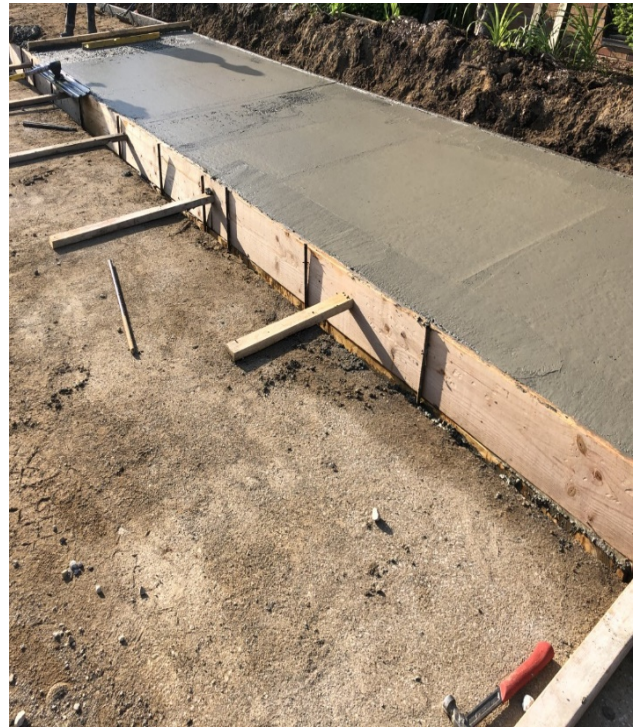
Clear Lake Elementary paved sidewalk