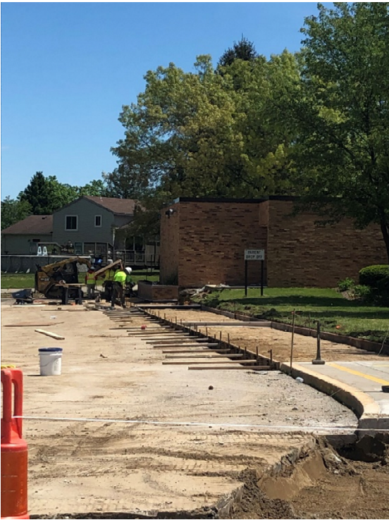
Clear Lake Elementary formed sidewalk