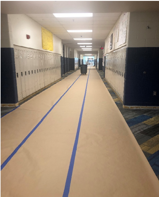
Oxford High School new carpet protection