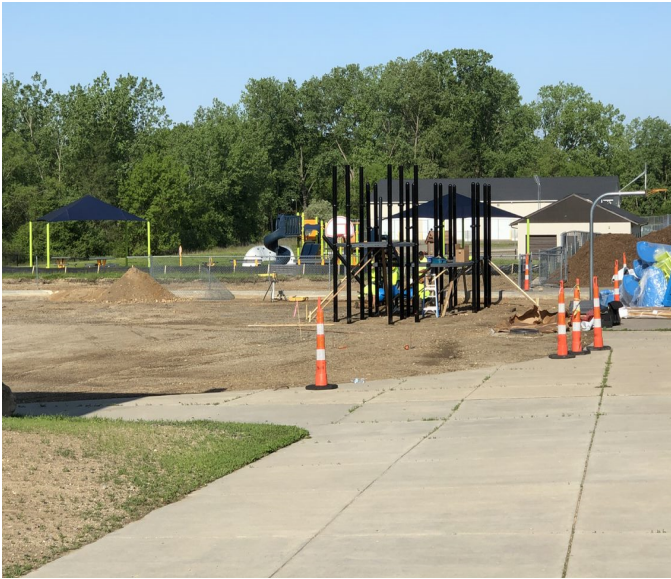
Oxford Elementary playground equipment