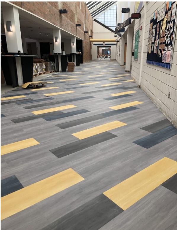
Oxford High School floor preparation