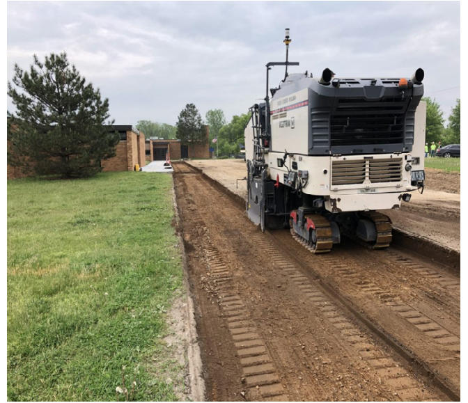
Oxford Elementary driveway resurfacing